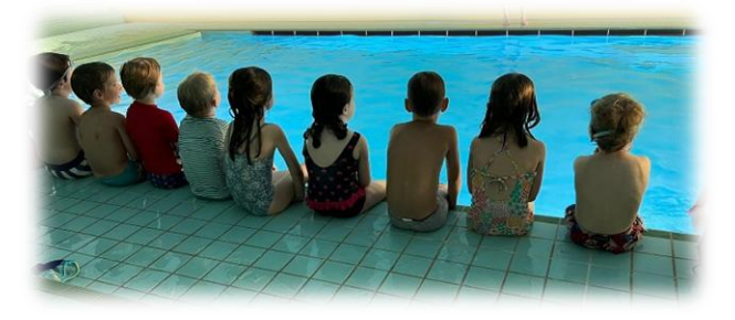
Pupils who took part in the swimming activity were awarded a badge to recognize their progress over the year.